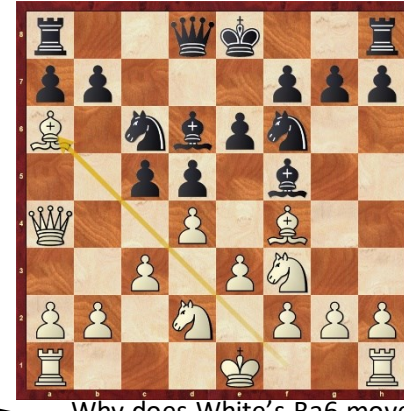
Why does White's Ba6 move win?